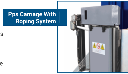
Pps Carriage With Roping System